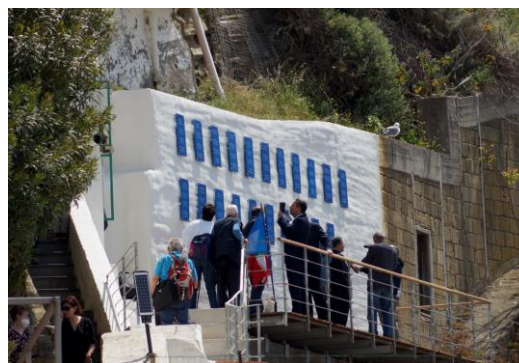
Inauguration of the Wall of Migrants Tuesday 3 May 2022

The Wall of Migrants, overlooking the port of La Corricella in Procida, pays tribute to these men and women, to their courage and determination, to build a new destiny by emigrating to other countries. Their names are engraved on plaques and their individual stories are accessible online on the Digital Wall.